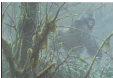
INTRUSION – MOUNTAIN GORILLA