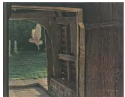
BARN OWL IN THE CHURCHYARD