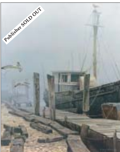
THE SARAH E. WITH GULLS