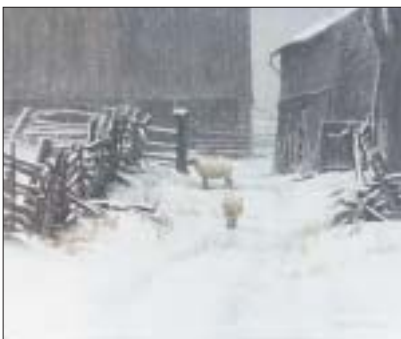
IN FOR THE EVENING