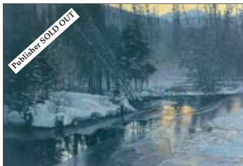
WINTER SUNSET – MOOSE