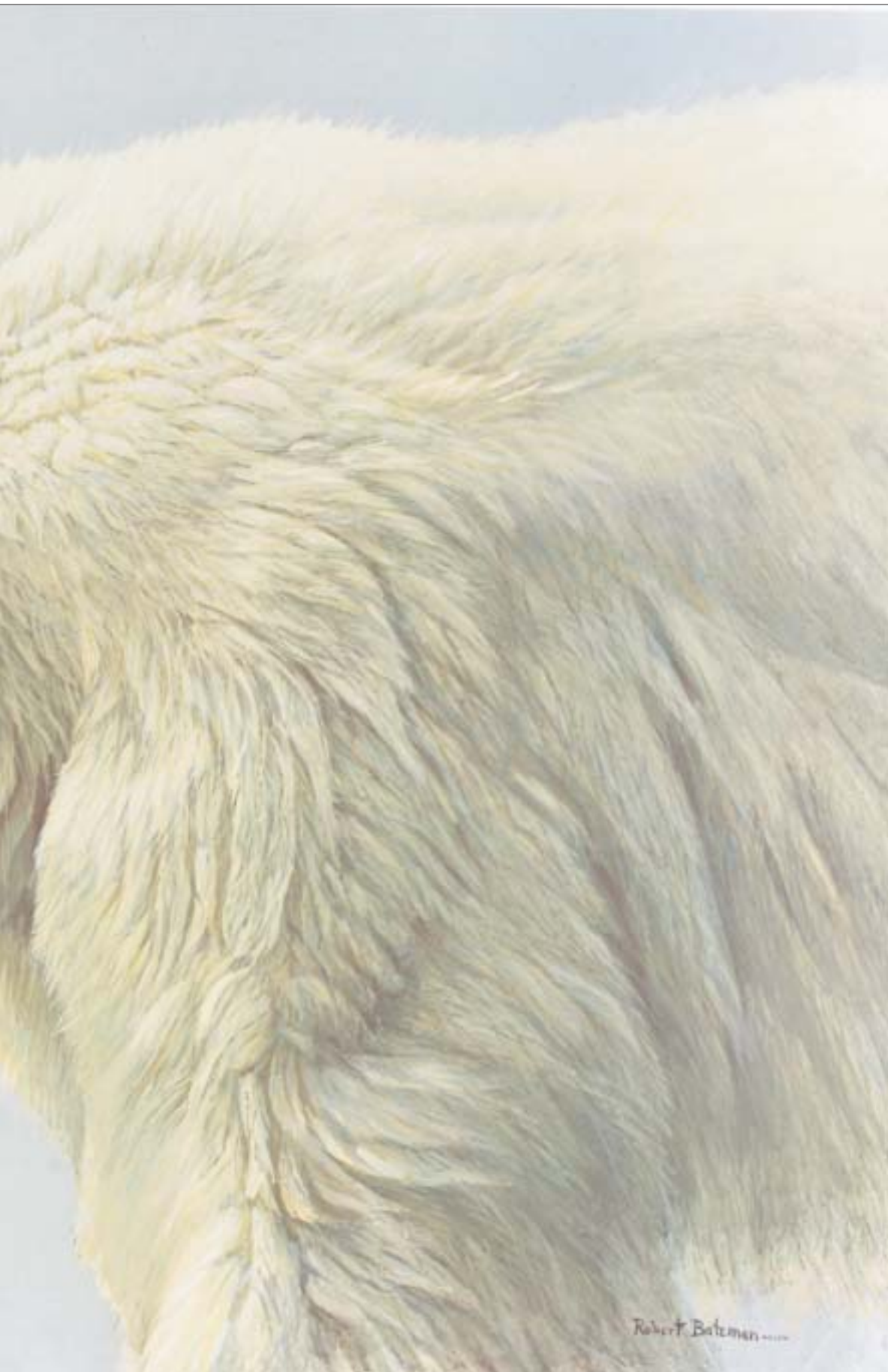
POLAR BEAR PROFILE © Robert Bateman Giclée Canvas $1,395 180 s/n plus 36 Artist's Proofs 26" x 39" (POLA0016) Publisher Low Inventory (A 950 s/n offset paper edition has previously been published. Publisher Sold Out)